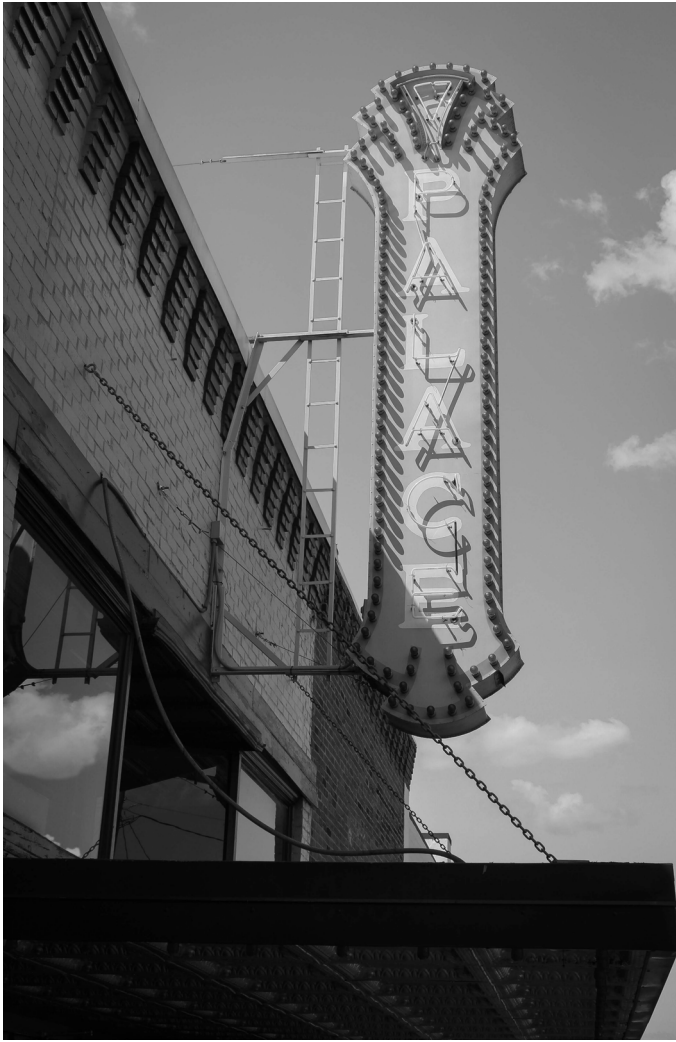
The Palace Trevor Blaisdell