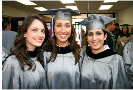
Meet a few of the newest Alum!