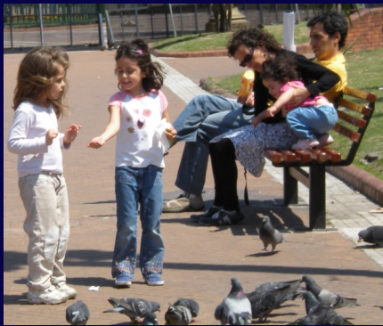
Children with their family feeding pigeons at a local park in Argentina.